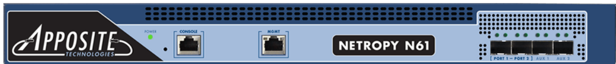
Optional SFP Interface Version

The front panel of the Netropy N61 contains: