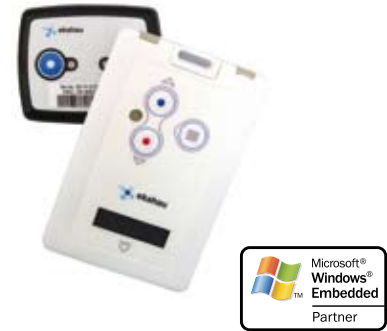
Ekahau T301 Wi-Fi tags